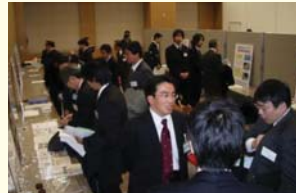
■ Business Matching Session for Transfer of Technology 2006

Business matching to promote partnerships between Kansai-based large global IT companies and venture businesses and research institutions around the world