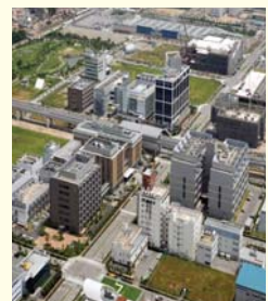
■ Kobe/Kobe Medical Industry Development Project