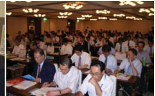
■ Digital Concept Partners Opening Forum