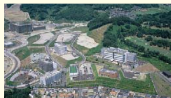
■ Osaka/Saito Bio Hills

Project for strengthening collaboration with overseas bio clusters