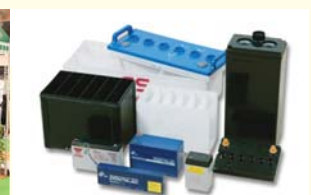
■ Battery cases made from recycled waste plastic