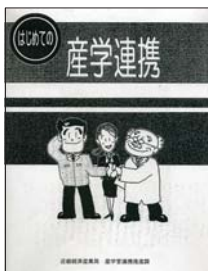
■ Guidebook Guide to Industry-Academia Collaboration