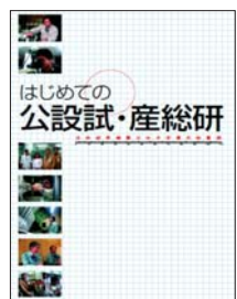
■ Guidebook Guide to Public Testing/Research Organizations/National Institute of Advanced Industrial Science and Technology