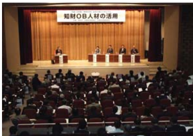
■ Invention Day Commemoration Event in FY2007