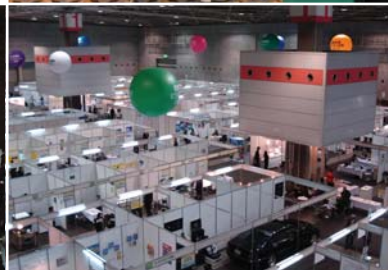
■ Intellectual Property Matching Fair 2006