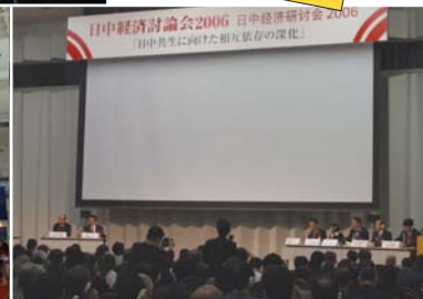
■ Japan-China Economic Conference