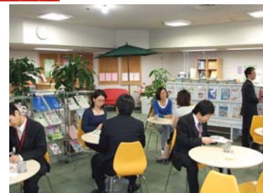
■ Job Café Program 'JOB Café OSAKA' JOB Café OSAKA seeks to develop human resources who can play a leading role in SME management innovation. JOB Café OSAKA provides job placement service for young people and recruitment support services for SMEs.