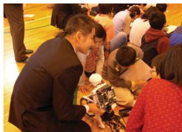
■ Career Education Project "Demonstration lesson on 'MURATA BOY'" The Career Education Project organizes various education programs to provide elementary and junior/senior high school students with the opportunity to learn about regional industries, thereby to encourage them to develop interests in society and foster their self-learning ability and skills.

There has been an increasing concern over the declining birthrate and aging population, the decreasing population and impending mass retirement of baby boomers, as well as the intensifying international competition. Amid these problems, it is extremely important to develop an environment that is conducive to the optimal development and use of human resources, which are fundamental to all production activities. The Economic Growth Initiative regards people as valuable assets, and states that making Japan a "nation built on talented human resources" is the mainstay of Japanese policy. In an effort to promote the development of highly specialized, innovation-oriented human resources, METI is implementing various programs and activities through strategic collaboration between industry and academia, to nurture competent human resources who can lead the future of Japan, and to provide highly professional education and employment support to excellent foreign students from Asia and other countries who wish to work for Japanese companies. METI is also working to create a network linking young people with SMEs to promote mutual understanding between them, thereby revitalizing regional industry.