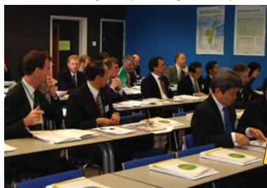
■ Kansai Bio Delegation (Cambridge/London)

To support overseas expansion of SMEs in the Kansai region, we provide various support services for companies wishing to expand their operations in foreign countries, including seminars, consultation with experts and exchange programs with overseas companies. We also implement various programs and activities to promote foreign direct investment in the Kansai region, by taking advantage of the high growth potential of the life science and other industries in the Region. We hold seminars in overseas countries and provide support services for local governments to help them implement their own foreign investment promotion projects.