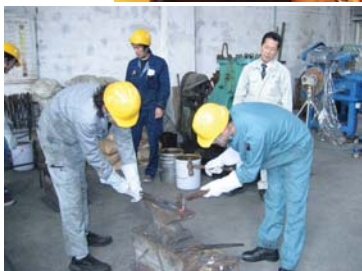
■ Program for SME Human Resource Development Using Technical College Resources - "Metal Processing Technique Training Workshop in collaboration with Nara Technical College" To meet the industrial needs of the Keihanna (Kansai Science City) area, Nara Technical College holds workshops on metal processing techniques to train highly skilled, competent technicians who can apply increasingly sophisticated techniques and methods in their daily work.