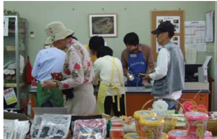
■Hidamari Salon Syaberoze (Gobo City, Wakayama Prefecture) Hidamari Salon Syaberoze was established in 2002 in a vacant store on a shopping street in Gobo City, to promote the independence of the disabled by providing them with a place to work, and to serve as a place for local residents' recreation and relaxation. Experts on store operation and management offer guidance and advice with the support of the government. Syaberoze seeks to promote the independence of the disabled, to create social entrepreneurial ventures, and to revitalize the shopping street.

(Note) Power supply region refers to the city/town/village location of a power generation plant under preparation, under construction or in operation, and surrounding cities/towns/villages.