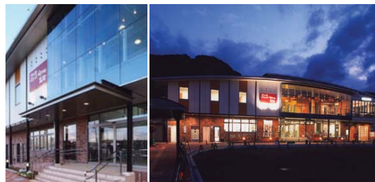
■Machi-no-Eki (roadside station) Plat-Home Takahama (Takahama Town, Fukui Prefecture)

In Takahama Town, Fukui Prefecture, the information and communication center Machi-no-Eki Plat-Home Takahama has been established on the premises of JR Wakasa-Takahama Station, with support from the government. There is a restaurant where any registered person can cook and serve food to guests, a multi-purpose room, an area for rental display boxes, and a market where fresh produce and other locally produced items are sold. This community facility, readily accessible by local residents, is expected to serve as a center for community development activities, with the active participation of local residents.