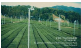
Tea plantations in Ujitawara (Kyoto)

Kansai has many refreshing and unique places to visit.