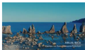
Hashigui-iwa Rocks (Wakayama)