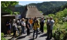
Stay and sight-see in Kayabuki-no-Sato

Provided by Osaka-Toka Co., Ltd. (The Kingdom of Compeito)