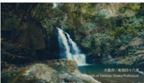
The 48 Waterfalls of Takihata (Osaka)