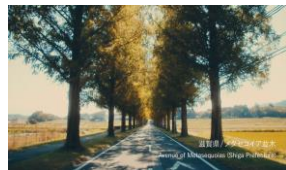
Avenue of Metasequoias (Shiga)