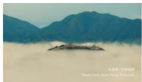
Takeda Castle Ruins (Hyogo)