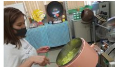
Confetti Candy-Making Workshop

Provided by Osaka-Toka Co., Ltd. (The Kingdom of Compeito)