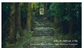
Daimon-zaka Slope on Kumano Kodo (Wakayama)