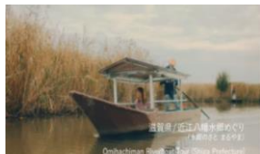
Omihachiman Riverboat Tour (Shiga)