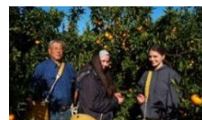
Green tourism hands-on experience programs

Provided by the Kyoto Miyama Tourism Association