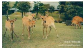
Nara Park (Nara)