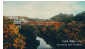
Kaiun Bungy (Nara)