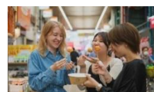
Accommodations that let you experience local everyday life