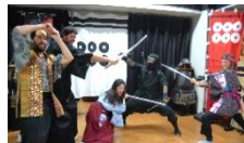
Samurai and ninja