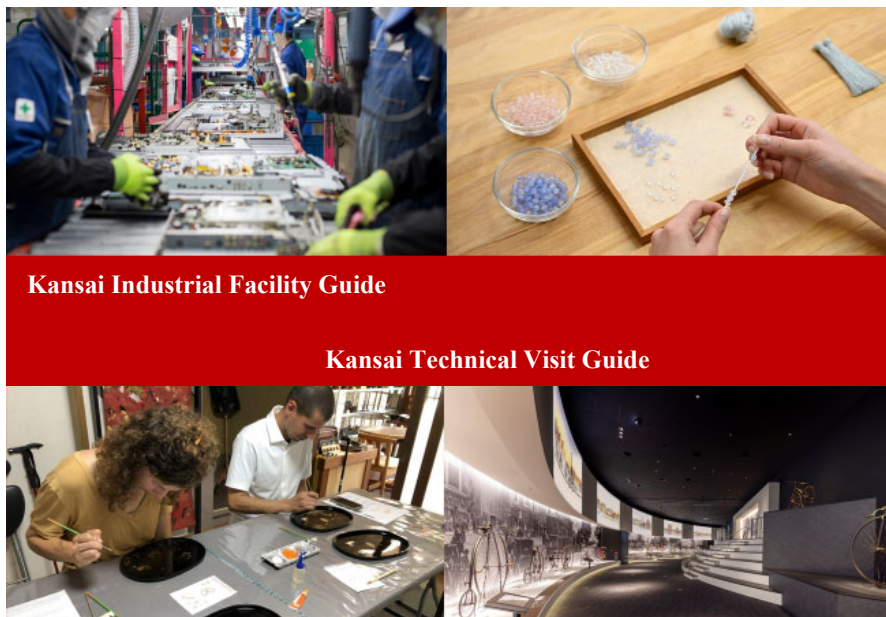
Kansai Industrial Facility Guide