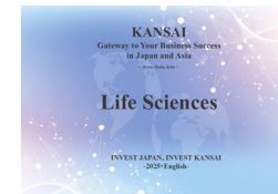
▲For Life Sciences