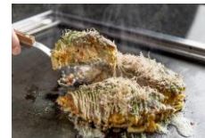
Okonomiyaki (Japanese style pancake) (Osaka)