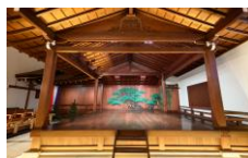
The Noh

Traditional culture has flourished around the ancient capital of Kyoto and various cultures have developed.