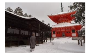
Snowy Koyasan (Wakayama)