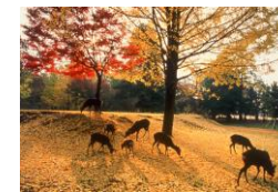
Deer in Nara Park (Nara)