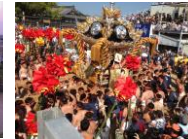
Nada Fighting Festival (Hyogo)