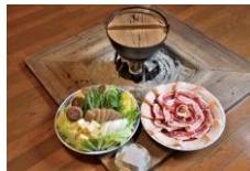
Botan nabe (Japanese wild boar hotpot) (Hyogo)

Food in Kansai is characterized by dishes that value dashi (soup stock) and bring out umami.