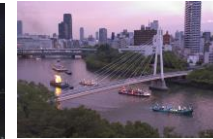
Tenjin Festival (Osaka)