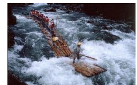
Kitayama River Log Rafting (Wakayama)