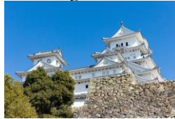
Himeji Castle (Hyogo)

Among the National Treasures of Japan, 71% of the traditional buildings and 51% of the art and crafts are in the Kansai region.