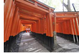
Fushimi Inari Taisha Shrine (Kyoto)