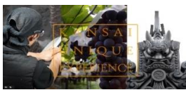
Video: Kansai Bureau of Economy, Trade and Industry

(Source) Population, demographics, and number of households based on the Basic Resident Register (as of January 1, 2025) from the Ministry of Internal Affairs and Communications