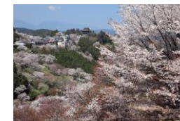
Cherry blossoms on Mt. Yoshino (Nara)

Being warm in the south and snowy in the north, you can enjoy diverse sceneries of nature each season.