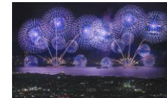
Lake Biwa Fireworks Festival (Shiga)

Many festivals are held every year in Kansai, including two of the three major festivals in Japan, the Gion Festival and the Tenjin Festival.