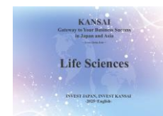
▲For Life Sciences