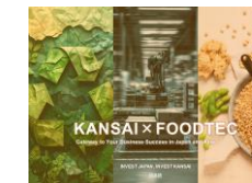
▲For Food Tech