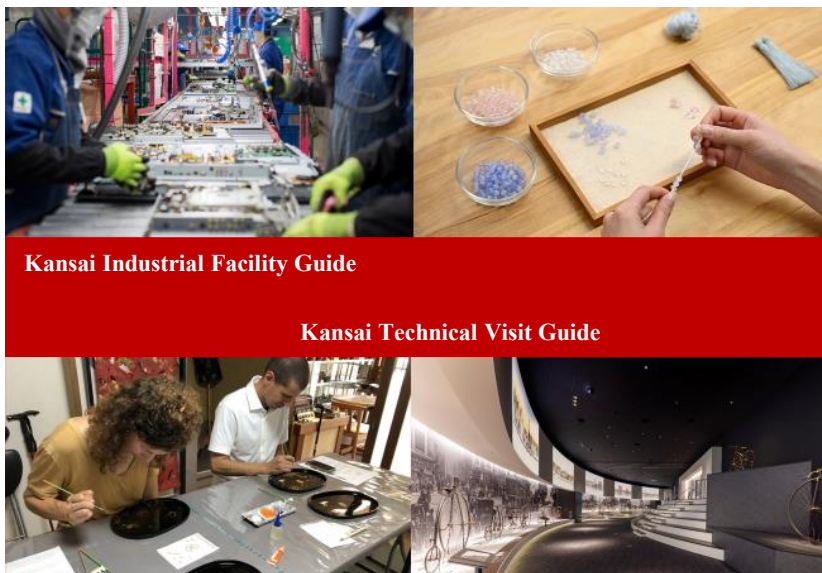
Kansai Industrial Facility Guide