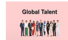
▲For Global Talent

To provide a deeper understanding of the investment environment in the Kansai region, we have made separate volumes available that gather information in six sectors.